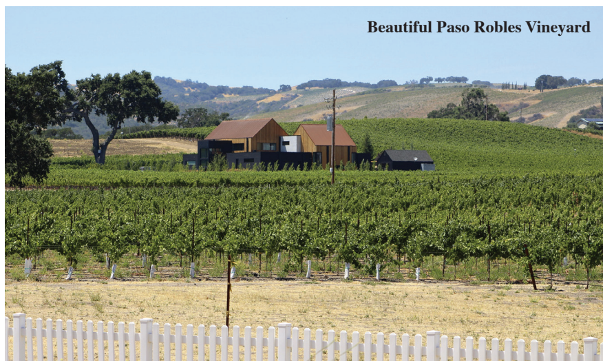
Beautiful Paso Robles Vineyard