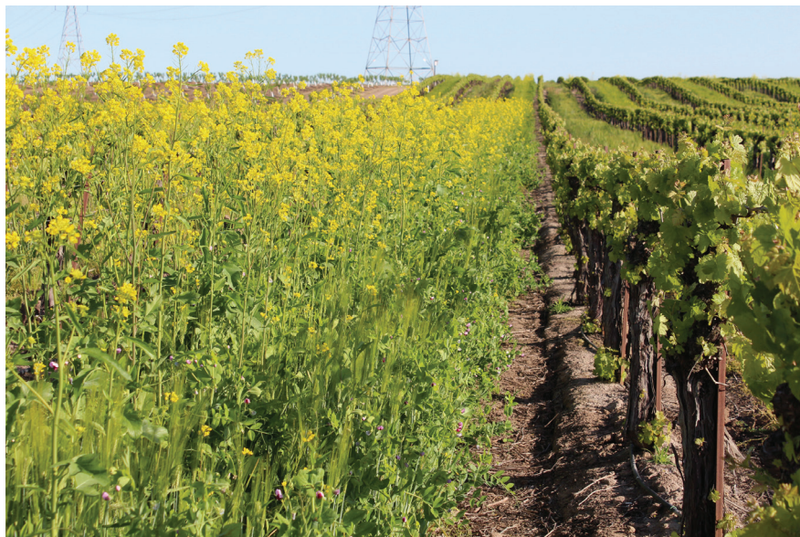
Don’t let the cover crops get too carried away as long as there is a threat of frost.

Growers should be mowing/incorporating their grasses/cover crops into the soil. “Make sure your cover crops don’t get too big,